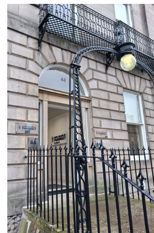
Left column: Delegates tour of the Edinburgh Botanic Gardens. Top: Delegates at the conference. Bottom left: More of the gardens. Bottom right: The Royal College of Pharmacy, Edinburgh.